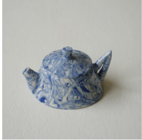
茶壺 Marbled Teapot NTD 10000