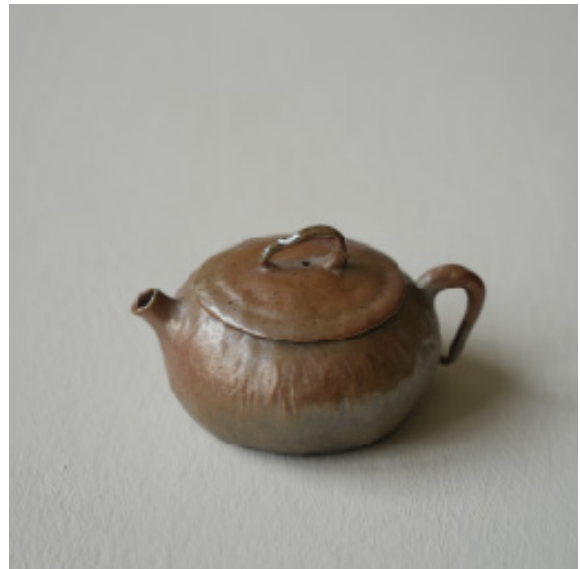
柴燒茶壺 Woodingfiring Teapot NTD 9000