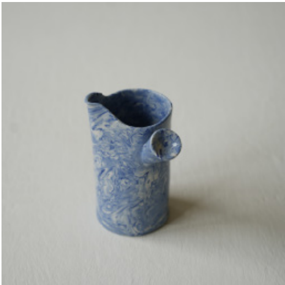
公道杯 Marbled Pitcher NTD 4000