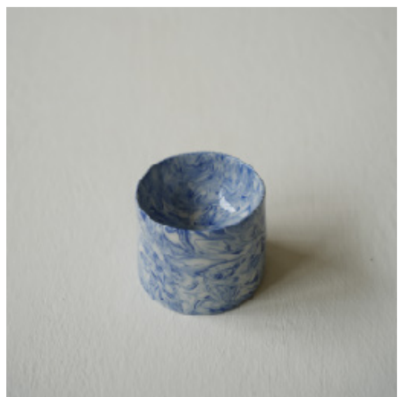
茶杯 Marbled cup NTD 3000