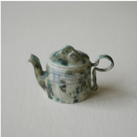
藍綠色茶壺 Soda Teapot NTD 9000