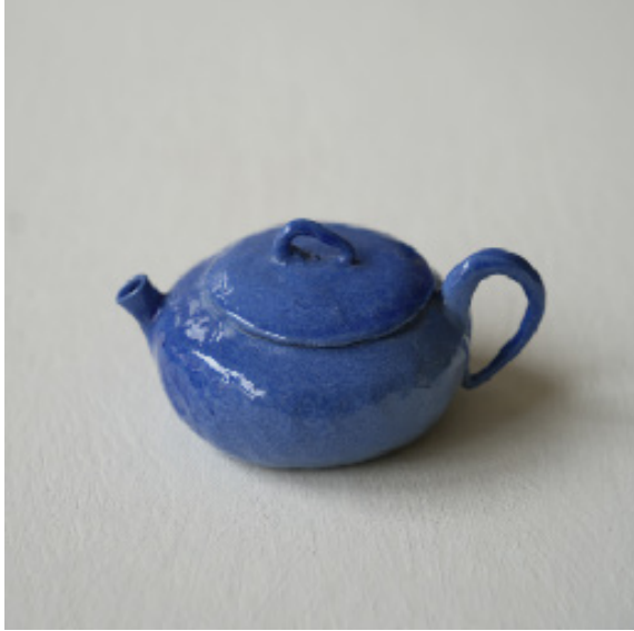
藍色茶壺 Soda Teapot NTD 10000