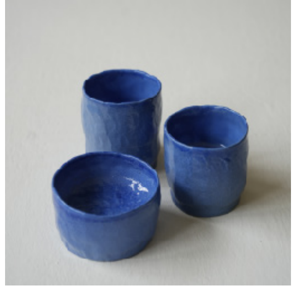
藍色茶杯 Soda cup NTD 2000