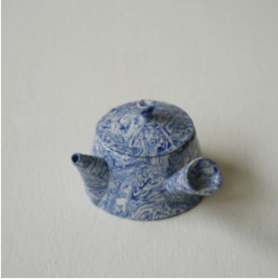
茶壺 Marbled Teapot NTD 10000